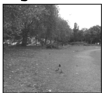
This shows the scrub clearance