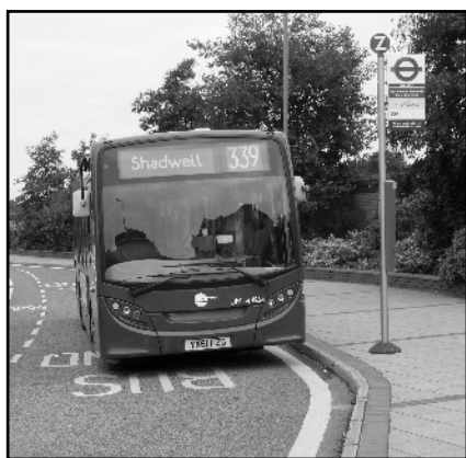
339 Bus pictured in Grove Green Road