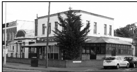
The Woodhouse Tavern

The Council has received a planning application to demolish the conservatory of the Woodhouse Tavern facing Woodhouse Road , and replace it with a single storey extension; also included are rear and side extensions at 1st floor level, and