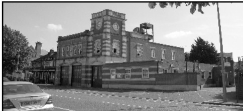
Leytonstone Fire Station

Finally, a new Fire Station for Leytonstone. Demolition work on the old building in the High Road is due to start in early December. The new station is due to be completed in about a year.