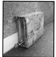
The latest dumping reported

The council will make their decision in January.