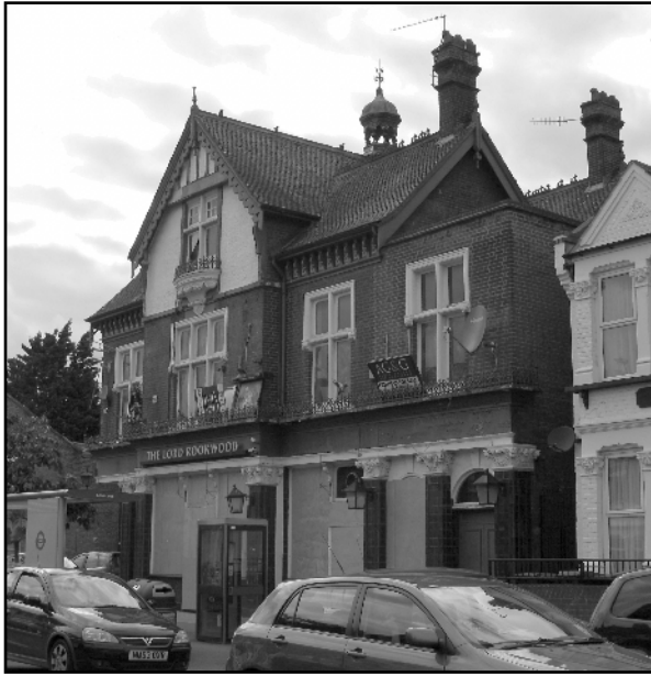
The Lord Rookwood pub in Cann Hall Road