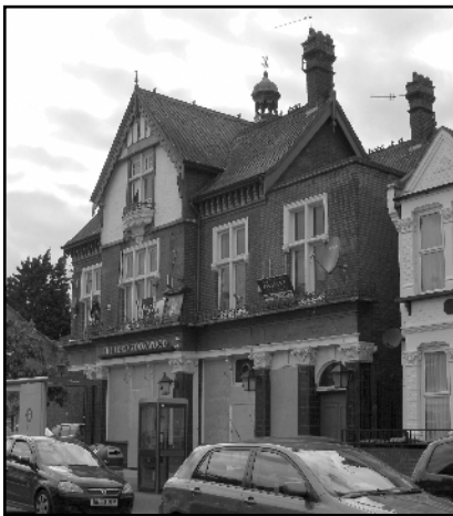
The Lord Rookwood pub in Cann Hall Road