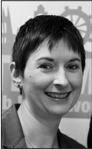
Lib Dem Mayoral candidate Caroline Pidgeon

Caroline Pidgeon, the Liberal Democrat candidate for Mayor of London , set out plans for half price fares on Underground, DLR, Overground and TfL Rail services for people who start their journeys before 7.30am.