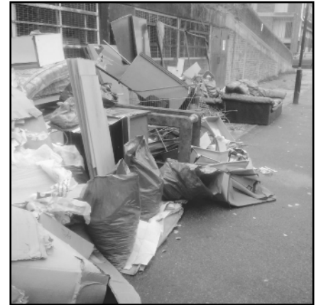
Fly tipping in the Sansom Road area

These two streets have been blighted by anti social behaviour of fly-tipping.