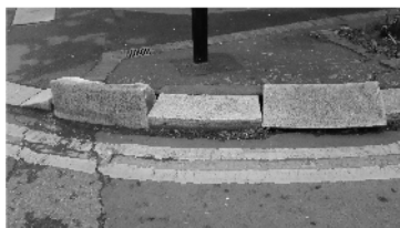
Trip hazards for the unwary at the corner of Thorpe Road