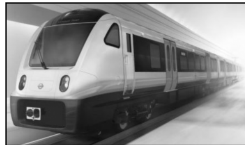
Artist's impression of new electric trains

This line will be closed for eight months later this year from early June until February 2017.