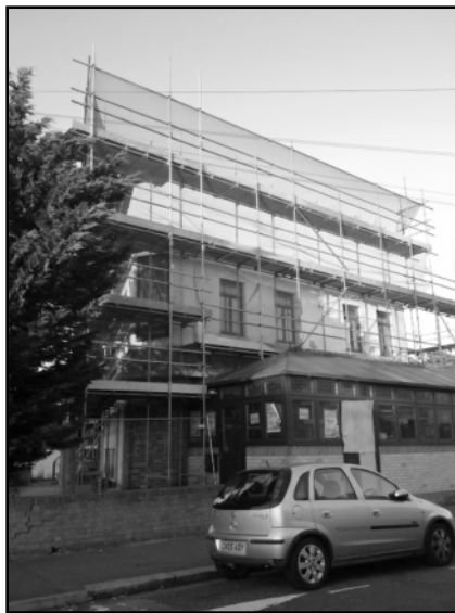
Woodhouse Tavern - works under way

Focus says: A sound insulation scheme will need to be installed between the pub and the residential above. Surprisingly, while a secure and lockable cycle store is to be provided there is to be no provision for car parking facilities for the residents.