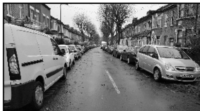
Huddlestone Road - heavily parked

During recent months the Liberal Democrat Focus Team has been carrying out street surveys to find out residents' views on this subject. This was driven by the amount of complaints we were receiving from residents. At first in surveys carried out in Trumpington and Thorpe Roads there