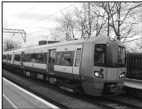
A diesel unit running on the Barking Line

The Gospel Oak to Barking line has now opened using two-car diesel trains. Unfortunately the installation of the overhead electric wires has not been completed on time. Network Rail plans to complete the works before the longer electric trains arrive early 2018.