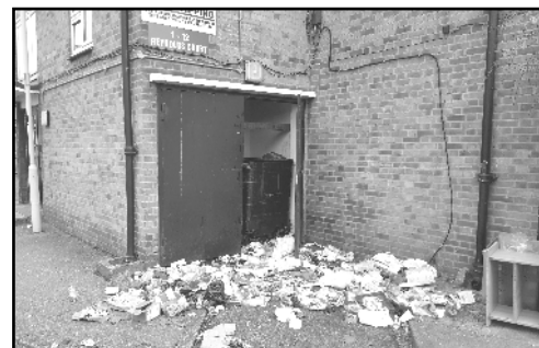
Rubbish outside Reynolds Court