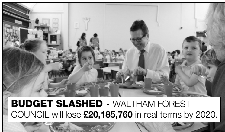
BUDGET SLASHED - WALTHAM FOREST COUNCIL will lose £20,185,760 in real terms by 2020.