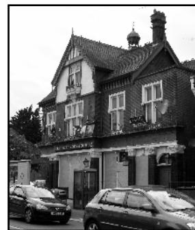
The Lord Rookwood