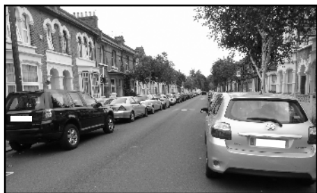
Parking in Cann Hall on a typical day